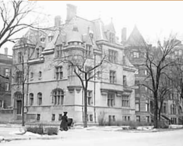
The Winter Palace: A French Chateau on Lake Shore Drive in Chicago designed for the Bordens by Richard Morris Hunt. The Carlyle replaced the mansion in the early 1960s.