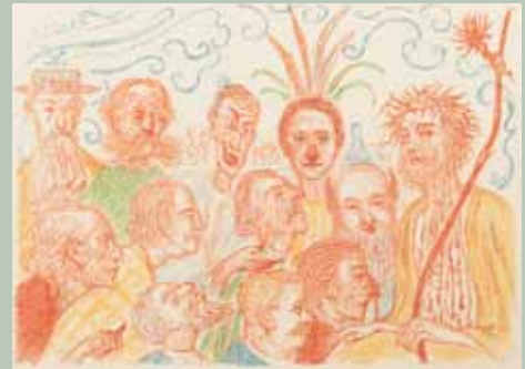
James Ensor XIX Le Christ livré aux critiques , 1921, lithograph on paper, 7 x 9 in (17.6 x 23 cm) from Scènes de la vie du Christ (Scenes of the Life of Christ), 1921 an album of 32 lithographs on paper, edition number 104/250